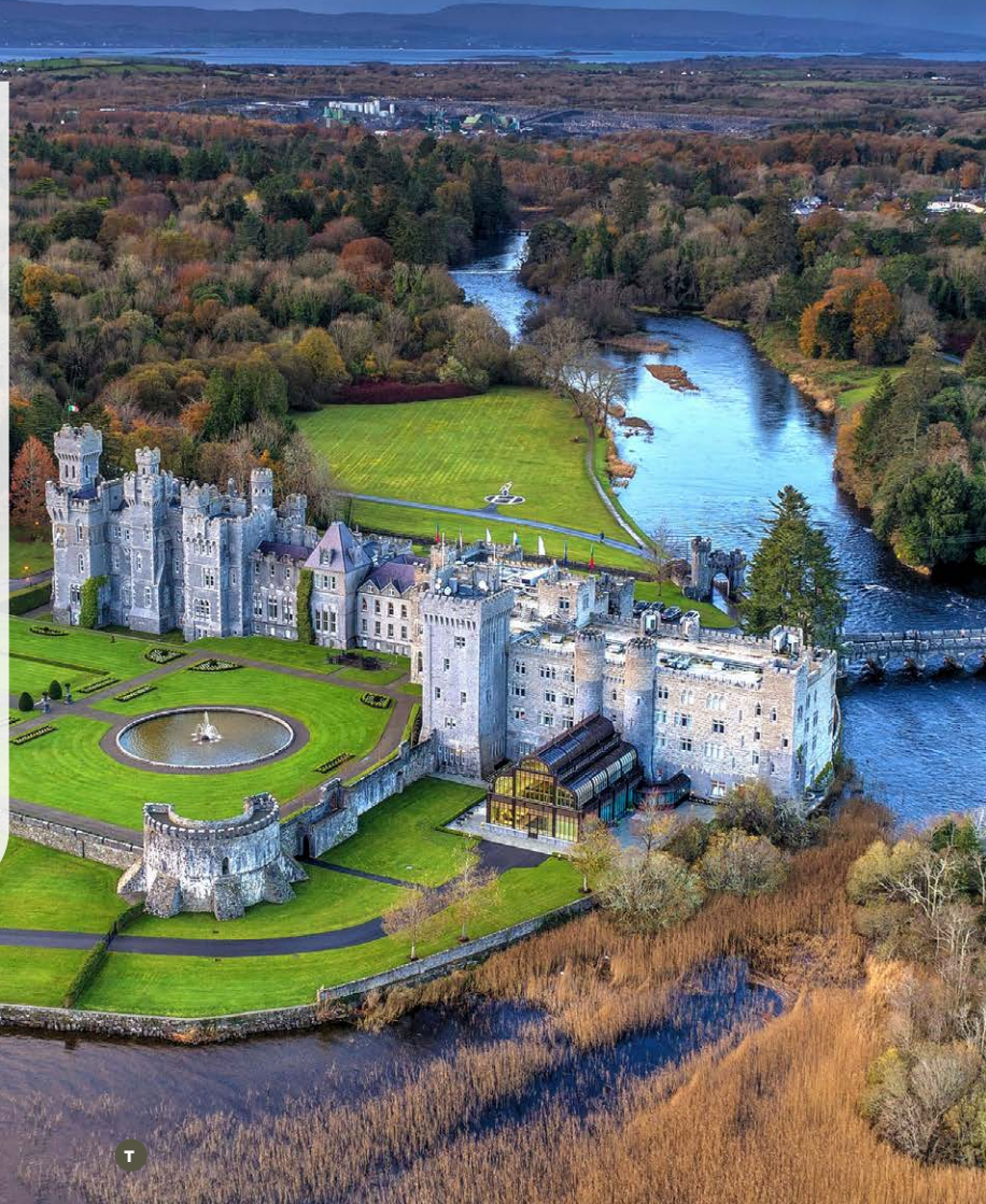
Aerial view Ashford Castle

The extraordinary characters of the castle passionately care about each guest experience. Ireland's only Forbes 5-star accredited hotel.